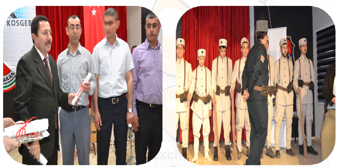
In Education of Detainees

In 2014, 69 conferences, 12 debates, 20 quiz contests, 7 theaters, 5 concerts, and such as 24 sporting activities 824 activities were organized and 41.731 inmates were provided to join.